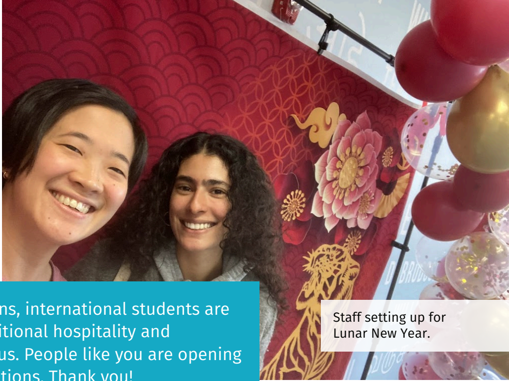
Staff setting up for Lunar New Year.

After years of pandemic restrictions, international students are once again starting to receive traditional hospitality and friendship out of reverence for Jesus. People like you are opening their homes and welcoming the nations. Thank you!